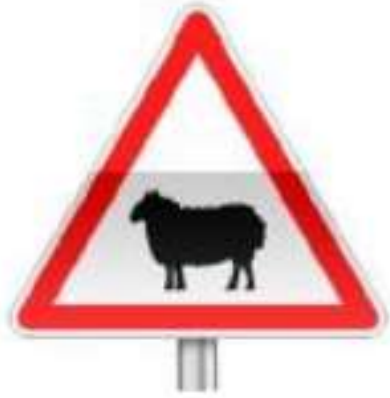
3. Sheep crossing the road!