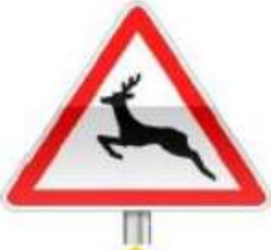
5. Reindeer crossing the road!