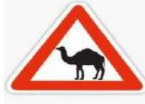
8. Dromedaries crossing the road!