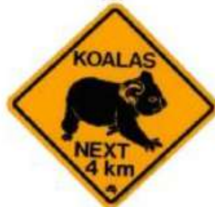
4. Koalas crossing the road!