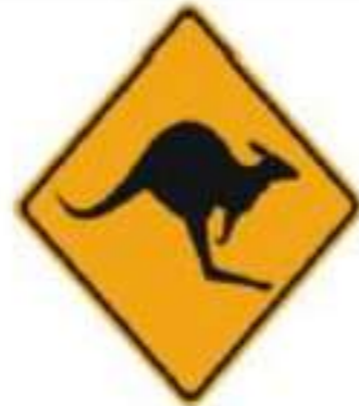
6. Kangaroos crossing the road!