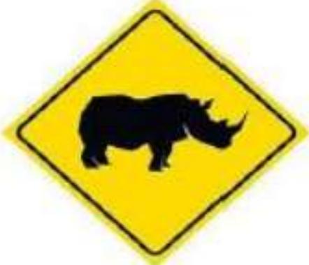
7. Rhinoceros crossing the road!