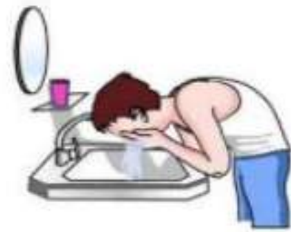
Wash your face

on + days : Monday – Friday at + weekends – night in + the morning ..... every + day week month..... after + school