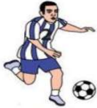
Football – Soccer