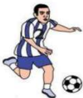
Football – Soccer